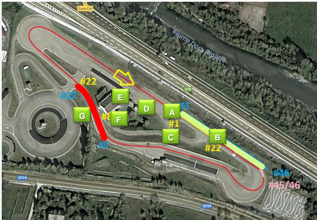
Italian test site: Places of demonstration guide tour visit